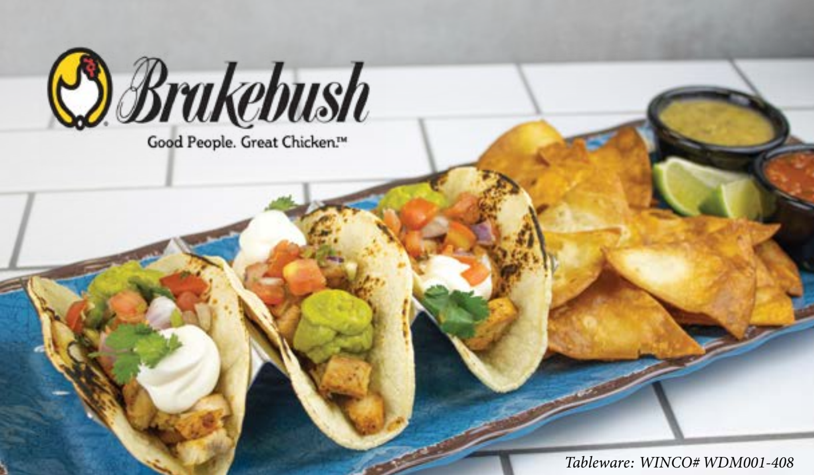
Tableware: WINCO# WDM001-408